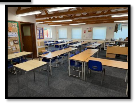
The children in Blue & Yellow Class especially have loved exploring their new Key Stage 1 area.

Even Green Class got a spruce up with some new carpet and a new layout.