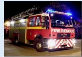
A fire engine