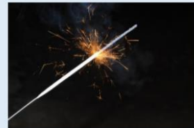
A dazzling sparkler

Bonfire night is when people remember a man called Guy Fawkes. On Bonfire Night you might see;