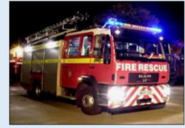
A fire engine