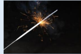
A dazzling sparkler

Bonfire night is when people remember a man called Guy Fawkes. On Bonfire night, you might see: